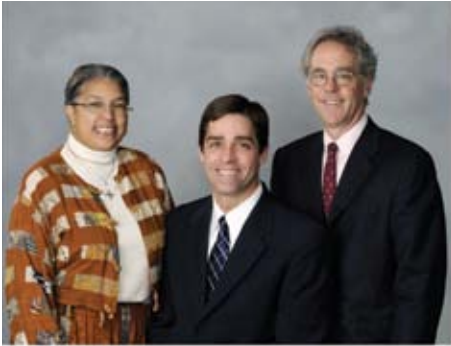
The Board of Park Commissioners Governing Body of Metroparks of the Toledo Area